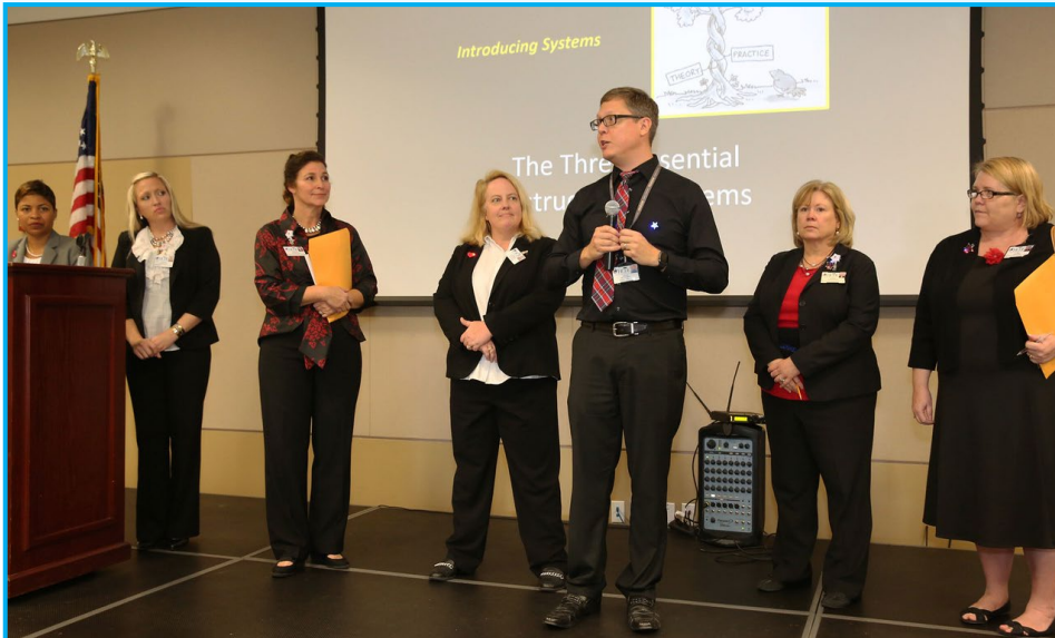
TLC Content Directors and Staff address conference attendees