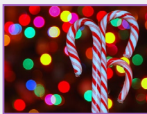
Rosa Siller's Retirement Celebration p. 2