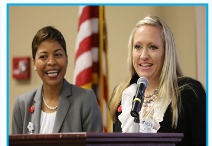
TLC Senior Director and Director help facilitate Summit