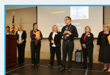
Leadership Summit p. 4